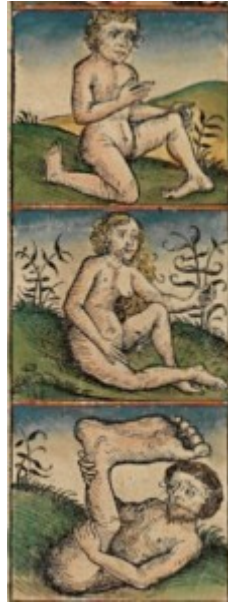
Fig. 1: Hartmann Schedel, Das buch der Cronicken [...], Nuremberg 1493, here at fol. 11v (detail). Public domain.

Medieval world maps ( mappaemundi ) attract a lot of attention, scholarly and popular, and rightly so. Ranging from the very simple T/O maps which show little else than the world divided into three parts (Asia, Africa, Europe) to giant, highly complex maps like the famous Ebstorf Map, they have a lot to offer. Thanks to digitisation projects like that of the British Library, it has become much easier to study these maps, or simply enjoy looking at them; have a look here if you like (and come back later).