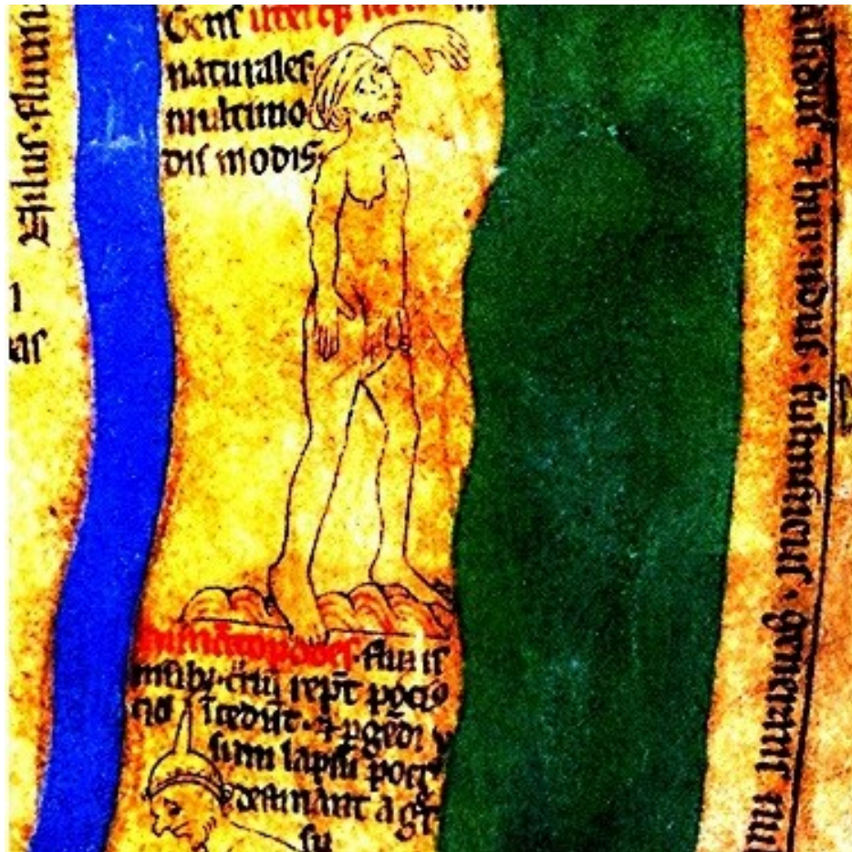
Figure 4: Hermaphrodites on the Hereford Map.

The Hereford Map (see Fig. 4) shows Hermaphrodites as nude humans with double genitalia and a double breast; this largely corresponds to the conventionally, vertically split depiction of hermaphrodites in medieval and early modern art. Face and hair, however, are not split, as they are in other medieval images of the hermaphrodite people (see, for example, Fig. 1). Interestingly, the hermaphrodite on the Hereford Map seems to have a beard. Much more clearly, the figure wears a turban.