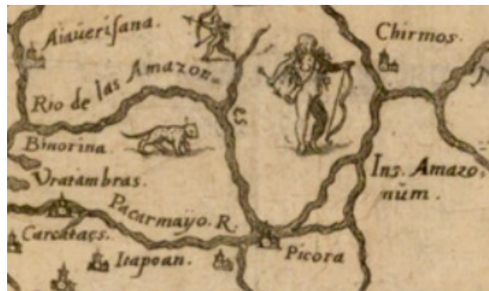
Fig. 2: Amazons at the Amazon River.

history (at 7.2.16) speaks of a double-sexed people called Machlyes ; elsewhere, he also uses the terms hermaphroditi and androgyni for double-sexed humans ( Nat. hist. 7.3.34), but not as ethnonyms. (On the Machlyes, see https://intersex.hypotheses.org/1021 ).